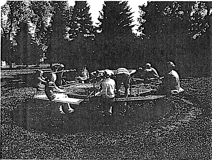
Field Trip to Prairie Village